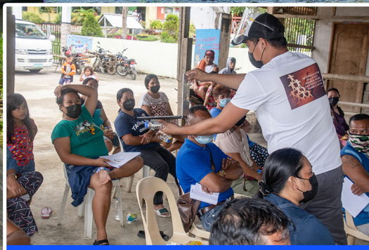
BCWD conducts 3 rd Watershed Community Symposium